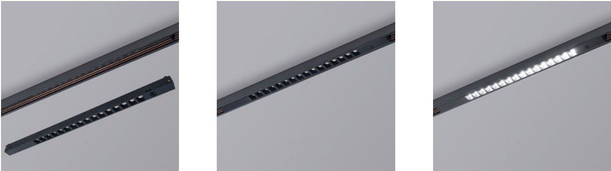
Binario low voltage