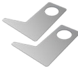
Removal kit for Walkabout Ground/FC.